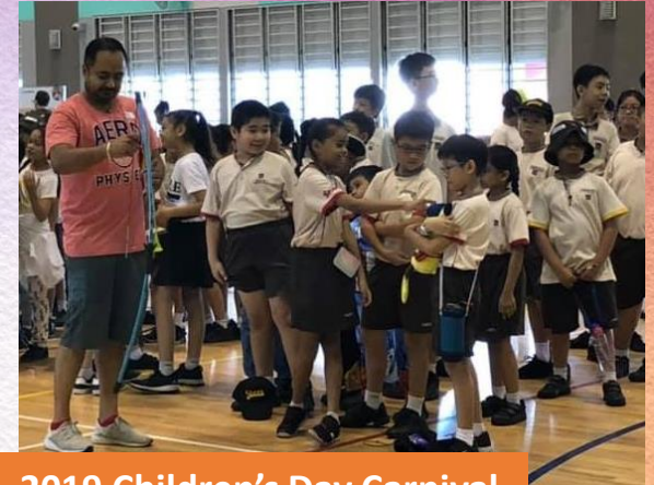
2019 Children's Day Carnival