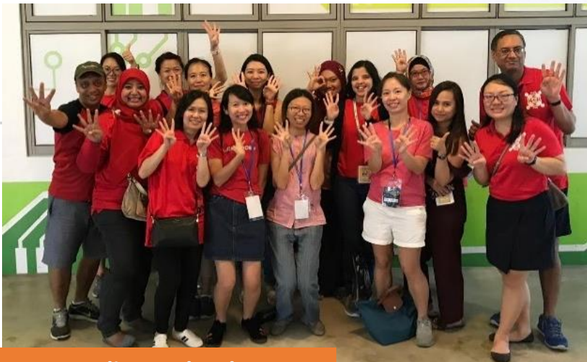
2019 Reading under the stars