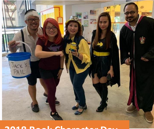
2018 Book Character Day