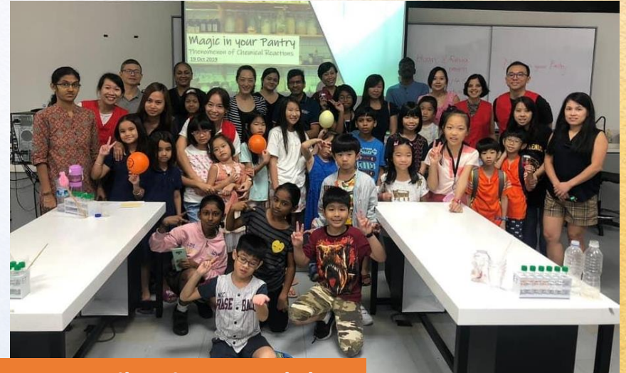
2019 Family Science Workshop