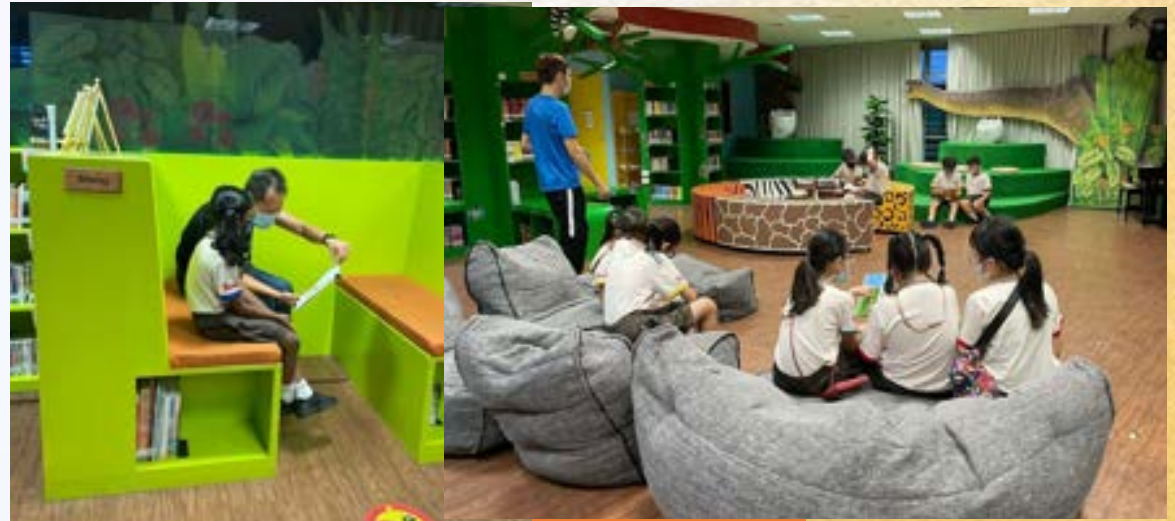
Paired reading & library PVs