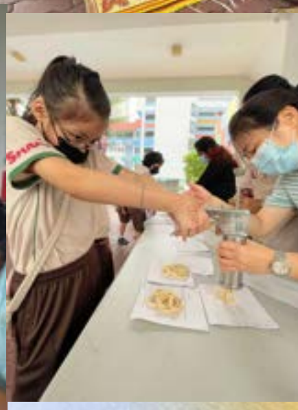
2022 Deepavali recess activity