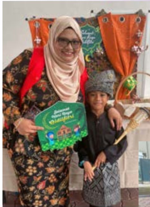
2023 Hari Raya recess activity