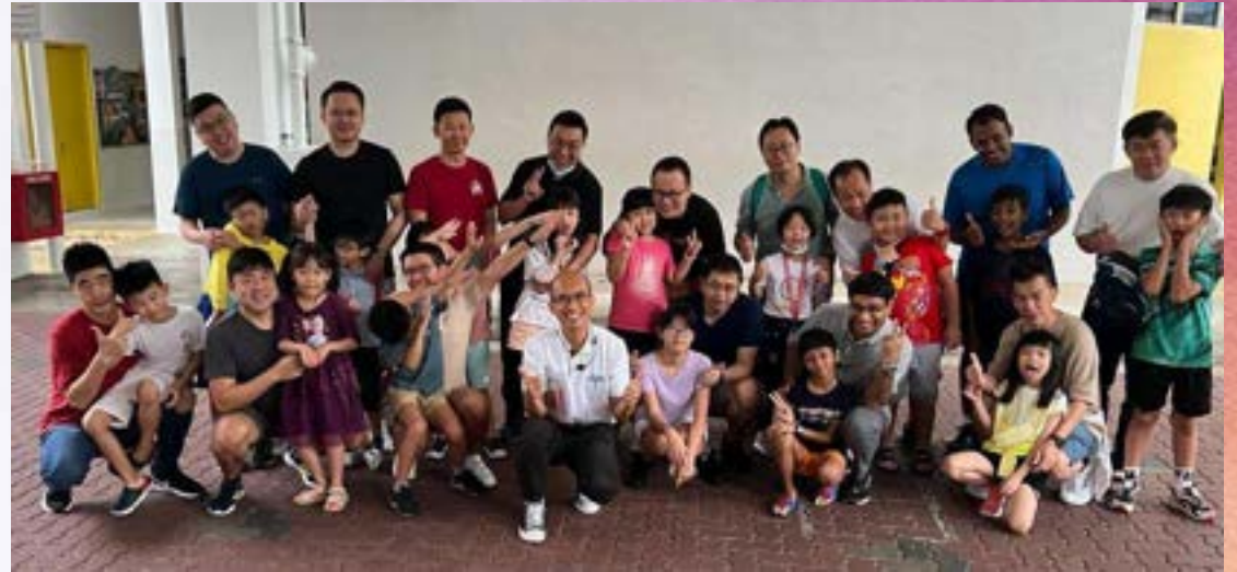
Dads for Life

(Centre for Fathering, Science Centre, COMPASS-MOE)