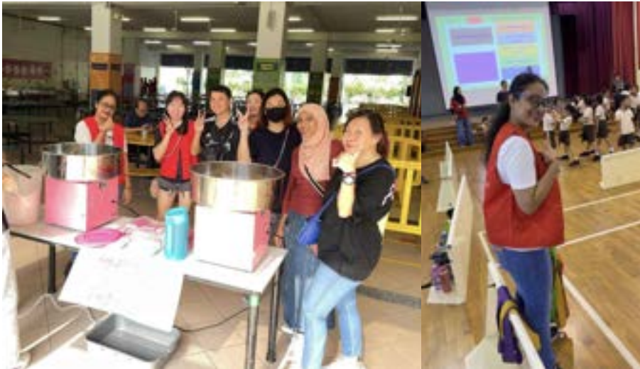
2023 Children's Day