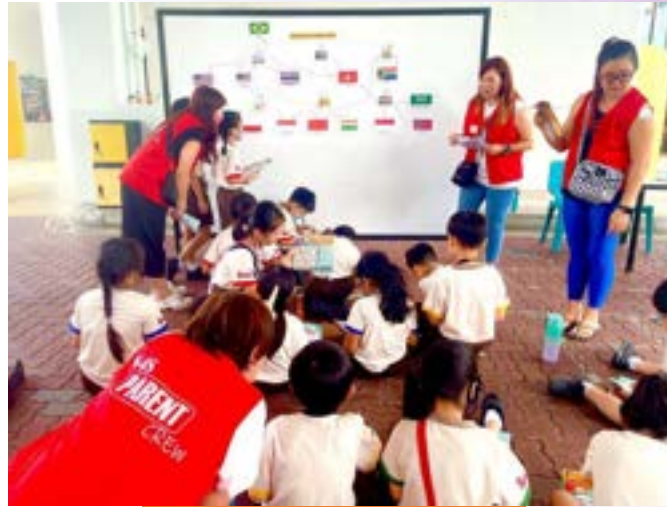
Total Defence Day