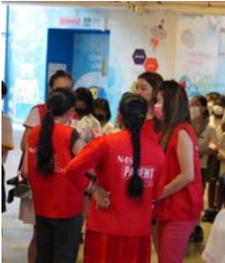
Teachers' Day planning