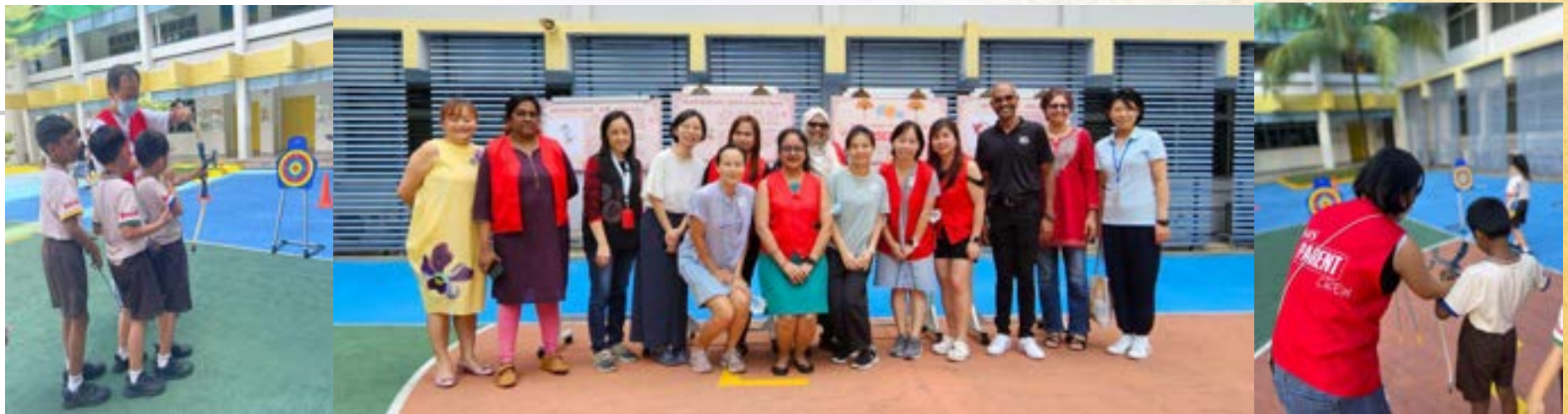
Mother Tongue Language Fortnight Activities