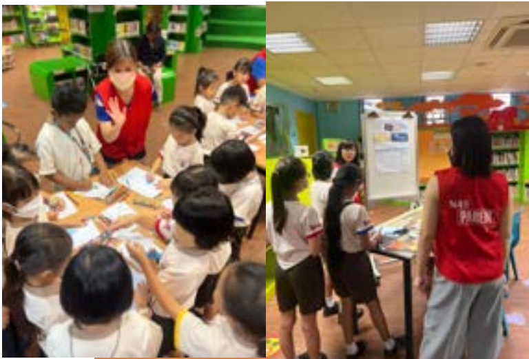
2023 World Water Day