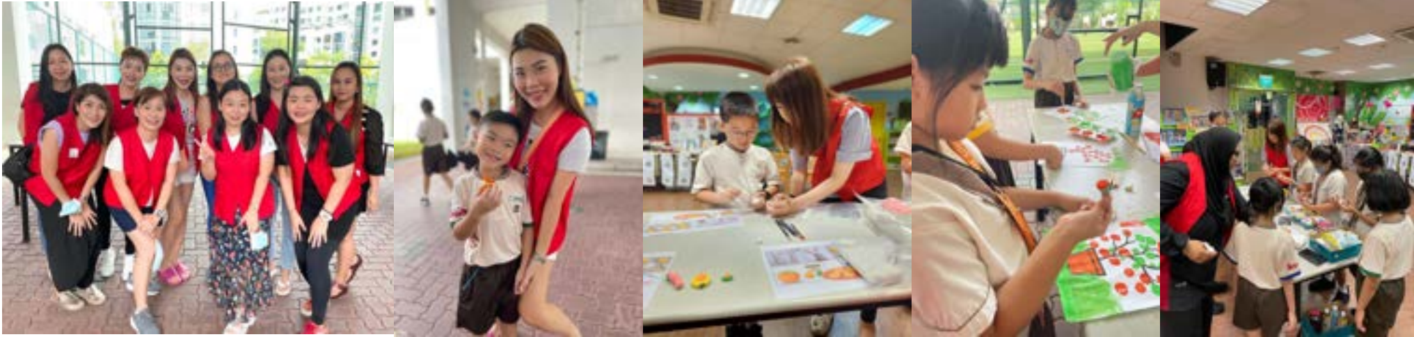
2023 Chinese New Year Recess Activity