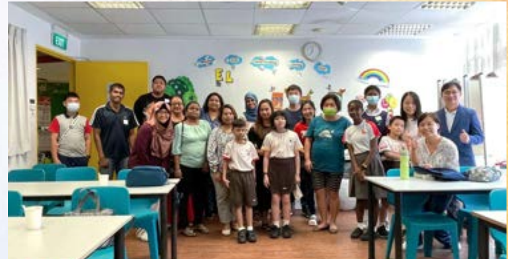
Let Us Chat