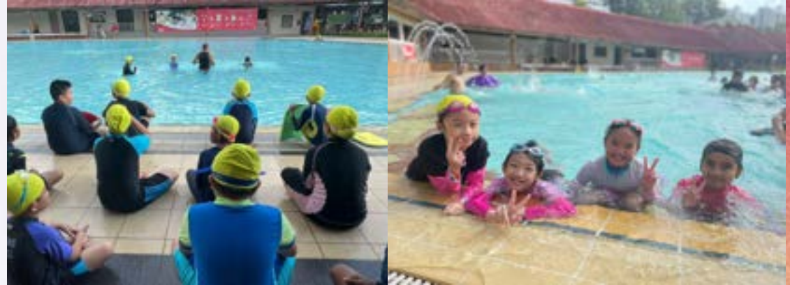
2023 Swimsafer Programme

(Recess activities, Learning journeys, School Programmes)