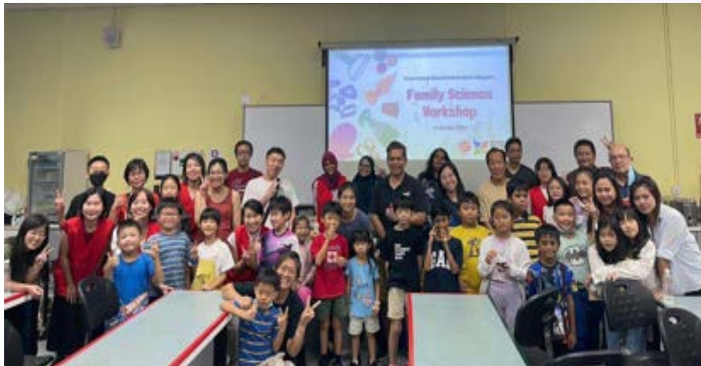
Family Science Programme